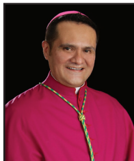
The Most Reverend Arturo Cepeda Auxiliary Bishop of Detroit "Path to the New Evangelization"