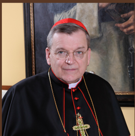
RAYMOND CARDINAL BURKE PREFECT, SUPREME TRIBUNAL OF THE APOSTOLIC SIGNATURE