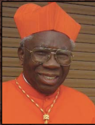
Direct from Rome Francis Cardinal Arinze

"Pray always without becoming weary Lk 18:1: The Importance of Personal Prayer in our Lives"